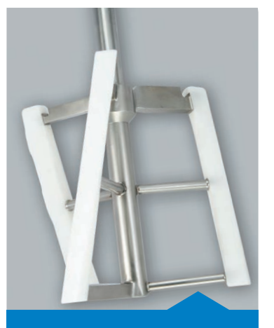
Optional 3E beater for all models, ideal for producing Ice Cream. Also available as a spare part.