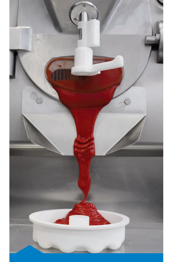
Thanks to the spacer , which can be mounted at any time, it is possible to reduce the door opening, thus facilitating the extraction of the Crystal product and the washing of the machine.