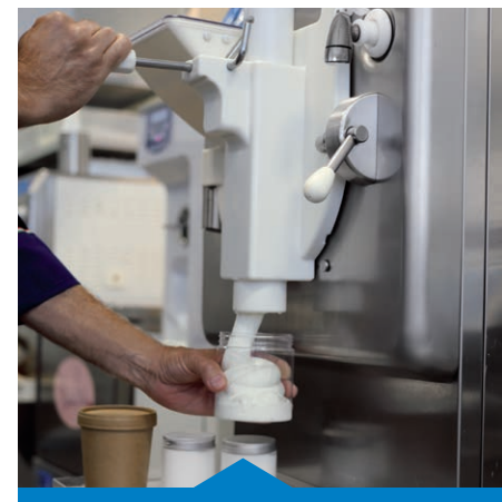
Optional Crystal Dispens ing Door . Ideal with the Crystal program for filling containers and jars directly from the machine.