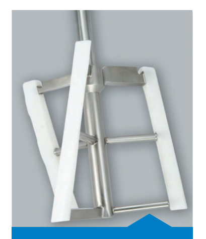
Optional 3E beater for all models, ideal for producing Ice Cream. Also available as a spare part.