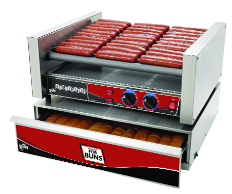
Models X30S Shown with XBW30

Star's Grill-Max<sup>®</sup> Express™ Roller Grills are covered by Star's oneyear parts and labor warranty.