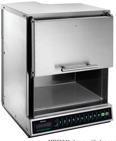
MOC5241 shown with door open