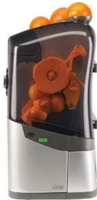
Zumex Minex Silver