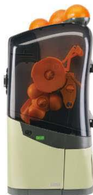
Zumex Minex Green